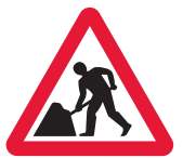
End of road works