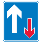
Priority over vehicles from opposite direction