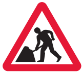
Road works ahead