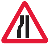
Road narrows on left-hand side ahead